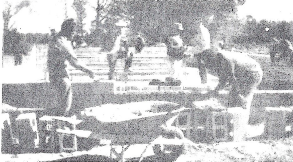
New Dining Hall--Holly Hill, S. Car.

"The brethren are building a new kitchen and dining room on the camp ground. This picture was taken Nov. 10 as saints and sinners alike came for work. It was good to see them cooperating and working together on this project, for the good of the cause and for the glory of God. More willing workers came and by mid-afternoon the walls were laid, praise the Lord. Pray that this building be completed before next camp meeting. Any additional help will be greatly appreciated."