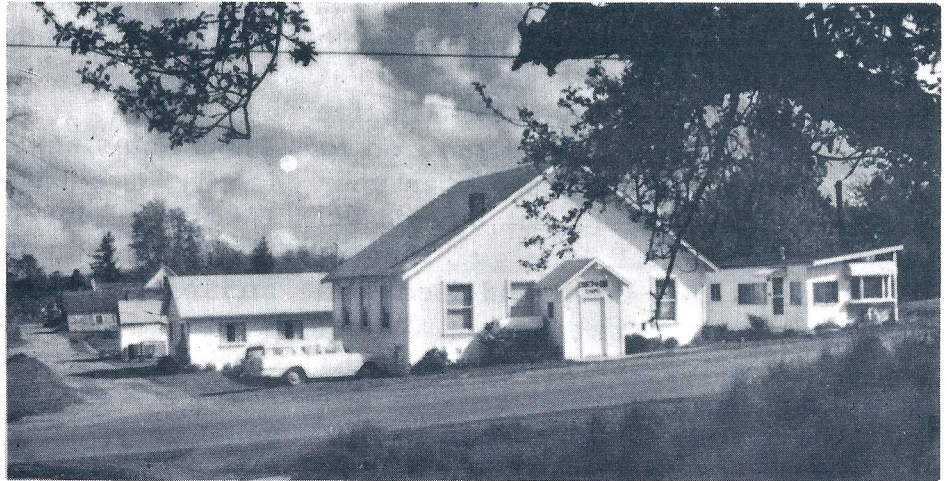
JEFFERSON OREGON CAMPGROUND