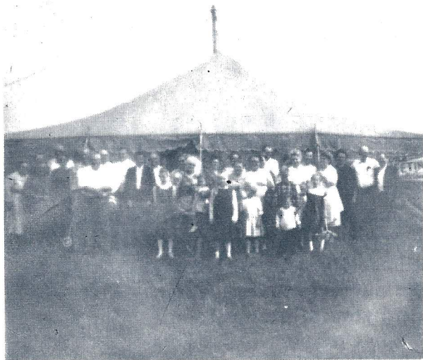
Tent meeting near Vinita, Okla. Sept. 1968